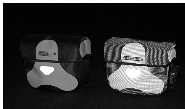
Comparison: Ultimate Six Classic (left), Ultimate Six High Visibility (right)