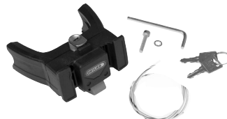
E207 Handlebar Mounting-Set E-Bike with Lock