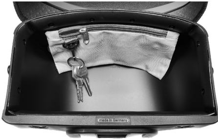
Carabiner with key chain