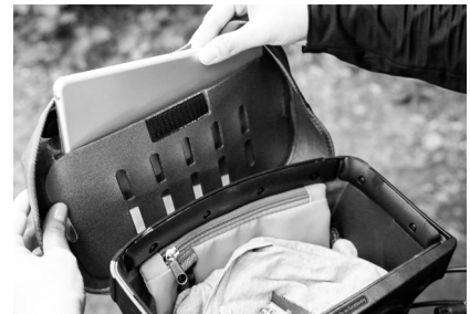
Opening lid compartment: 21,5cm / 8.5in.