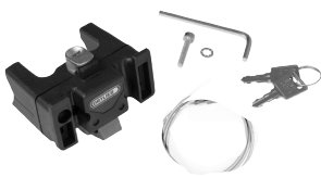
E185 Handlebar Mounting-Set with Lock

Handlebar mounting-set (sold separately):