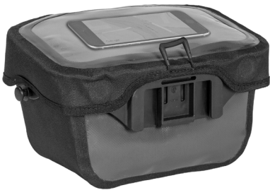
Smartphone in transparent lid compartment (not included)