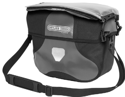
Mounting of optional accessory Ultimate Six Map-Case (not included)