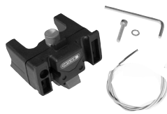
E225 Handlebar Mounting-Set