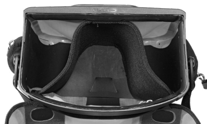
Ultimate Six Internal Divider (not included)