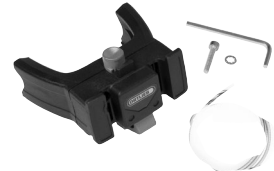
E226 Handlebar Mounting-Set E-Bike