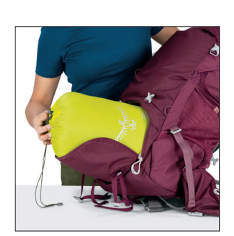
SLEEPING BAG COMPARTMENT

Upper and lower compression straps provide added stability when the pack is not full or offer additional attachment points for carrying gear on the outside of the pack.