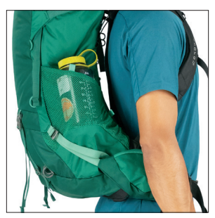
DUAL MESH SIDE POCKETS M - 65 L / 50 L W - 65 L / 50 L