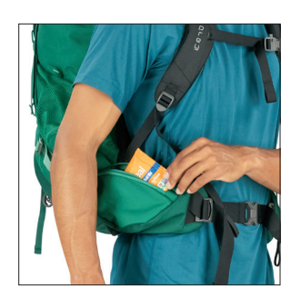
ZIPPERED HIPBELT POCKETS M - 65L / 50L W - 65L / 50L