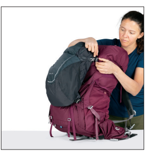
DUAL UPPER AND LOWER SIDE COMPRESSION STRAPS