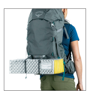
SLEEPING PAD STRAPS

Lower zippered compartment for dedicated sleeping bag storage with detachable divider for unimpeded access to pack interior.