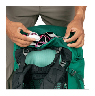
TOPLID WITH POCKET M - 65 L / 50 L W - 65 L / 50 L