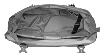
Inside: padded laptop sleeve